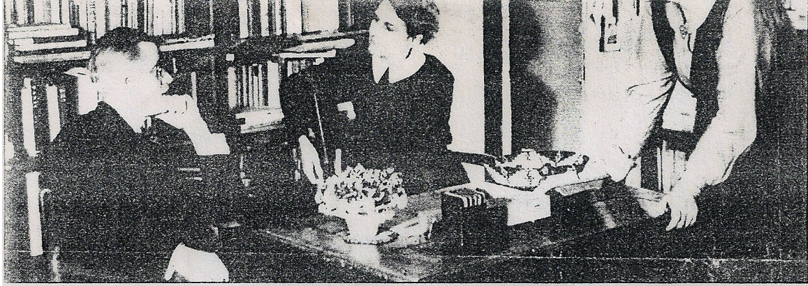
James Joyce, Sylvia Beach, center, and Adrienne Monnier are featured in "Paris Was a Woman."